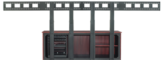
Custom option mount for three displays